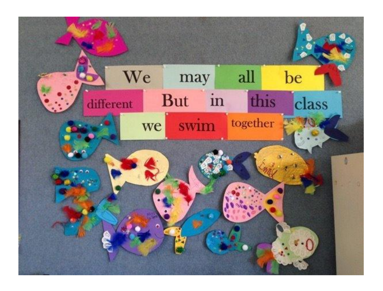
Appendix J: Cooperative Groups Logo